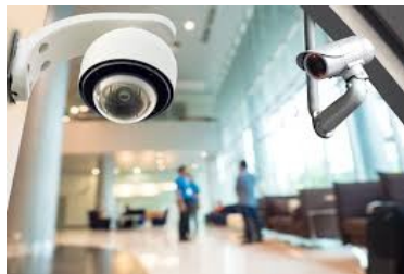
Security Systems (CCTV)

For low-voltage cabling, we cover both security systems and structured cabling. For IT, our technicians perform racking, stacking, and cabling of IT data centers, telecom closets and network data cabling in addition to wireless surveys and installations.