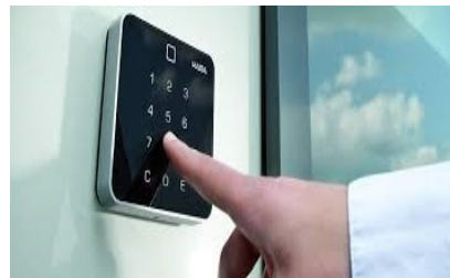
Security Systems (Access Control)